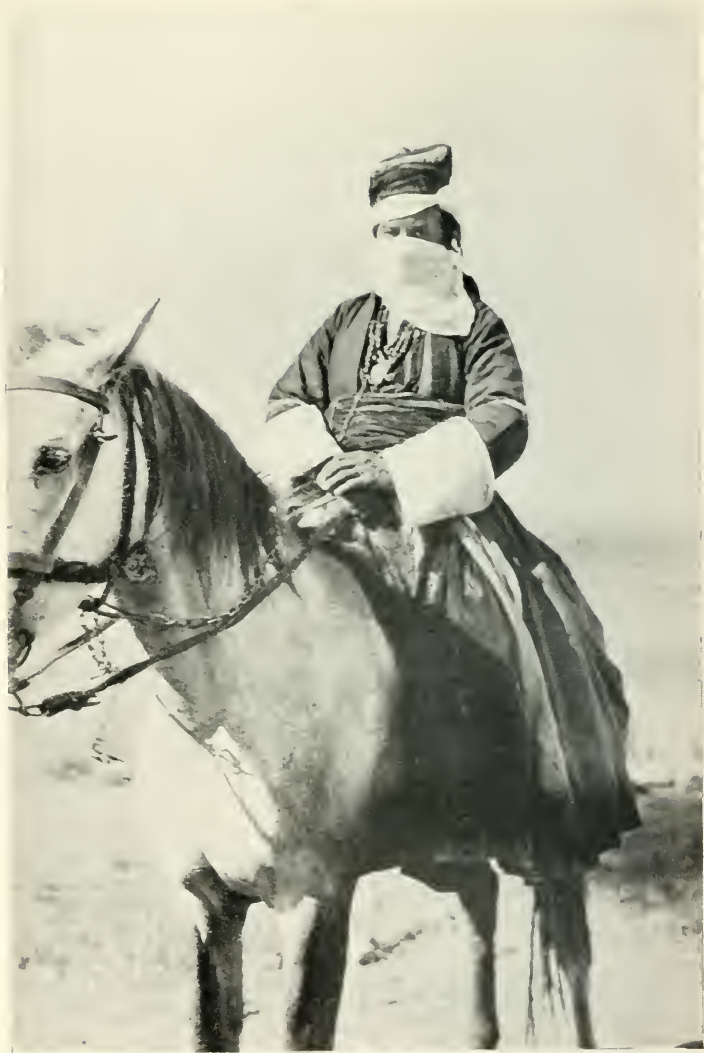
THE CHIEF'S WIFE